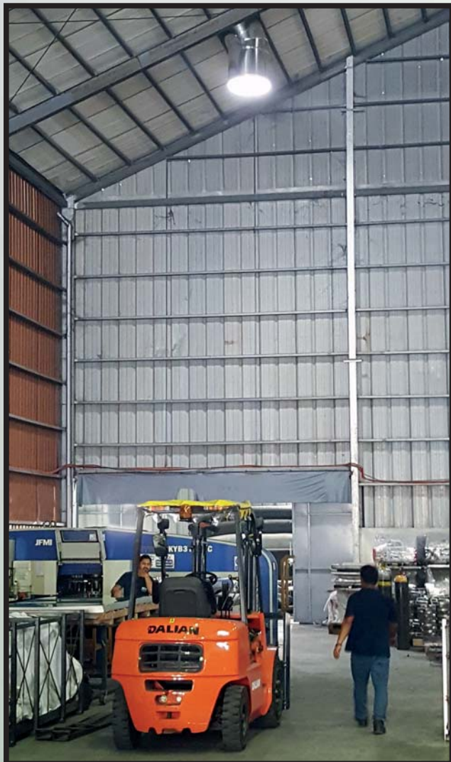
800mm Sky Tunnel installed in Steelfab Asia Factory.

Available in the following diameters: 750mm, 800mm, 900mm & 1000mm